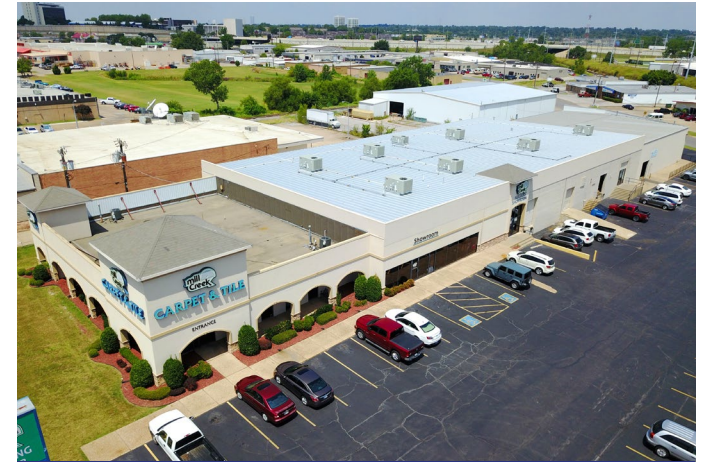
Mill Creek Carpet and Tile